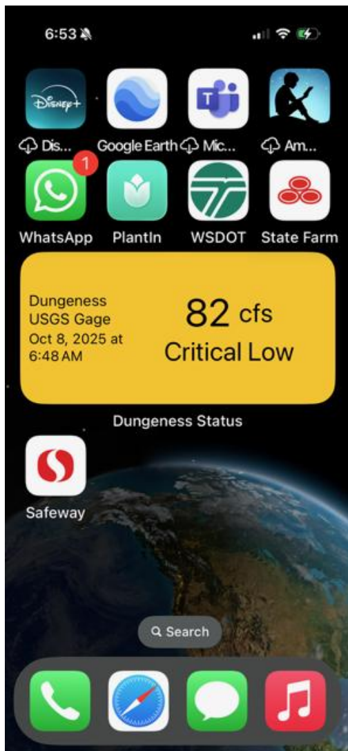
Screenshot showing Flow Widget

* The Washington State Department of Commerce Tribal Climate Resilience Grant program is supported with funding from Washington's Climate Commitment Act. The CCA supports Washington's climate action efforts by putting cap-and-invest dollars to work reducing climate pollution, creating jobs, and improving public health. Information about the CCA is available at climate.wa.gov ."